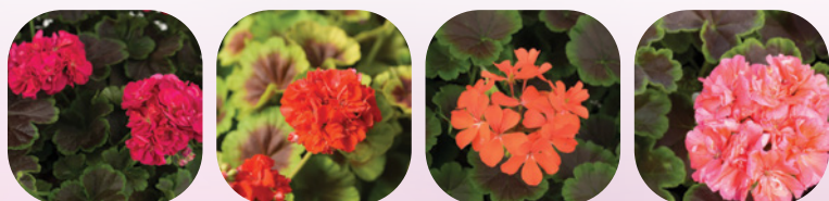
Geranium - Brocades