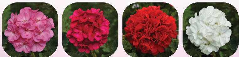
Geranium - Zonal