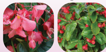
Begonia - Dragon Wing